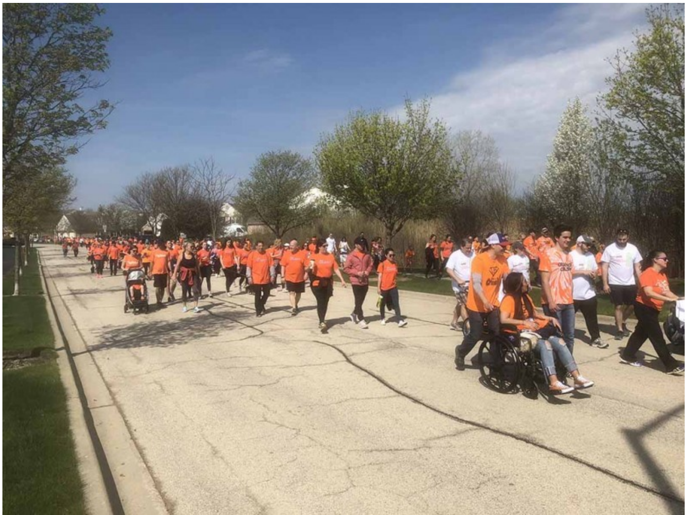
The MS Walk progresses through Schaumburg.