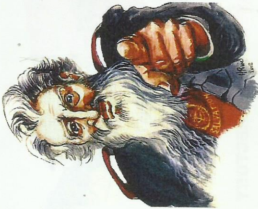
General William Booth Founder of The Salvation Army