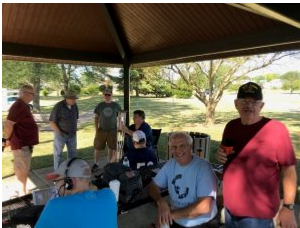
SARC in the Park August 10th 2019