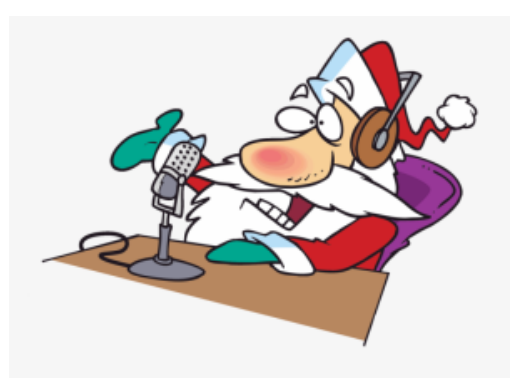
Date: Thur. January 16th, 2020 Time: 7pm Garibaldi's Italian Eatery, Hoffman Estates