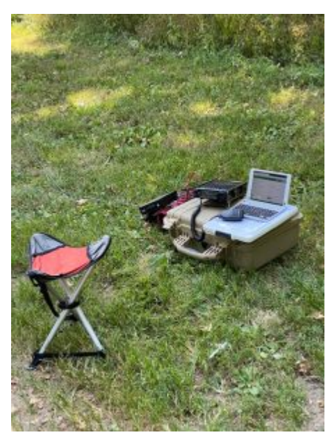
K9KMV Portable for Parks On The Air

Last Labor Day weekend, I headed out with my portable radio gear to Shabbona Lake State Park, designation (POTA K-4103) with the intent to do a POTA (Parks On The Air) activation. For those that know me, they know how much I enjoy the outdoors, and combining it with ham radio is an added bonus.